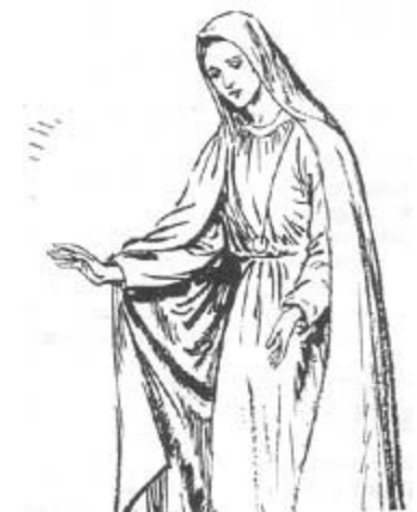
Ave Maria Purissima!